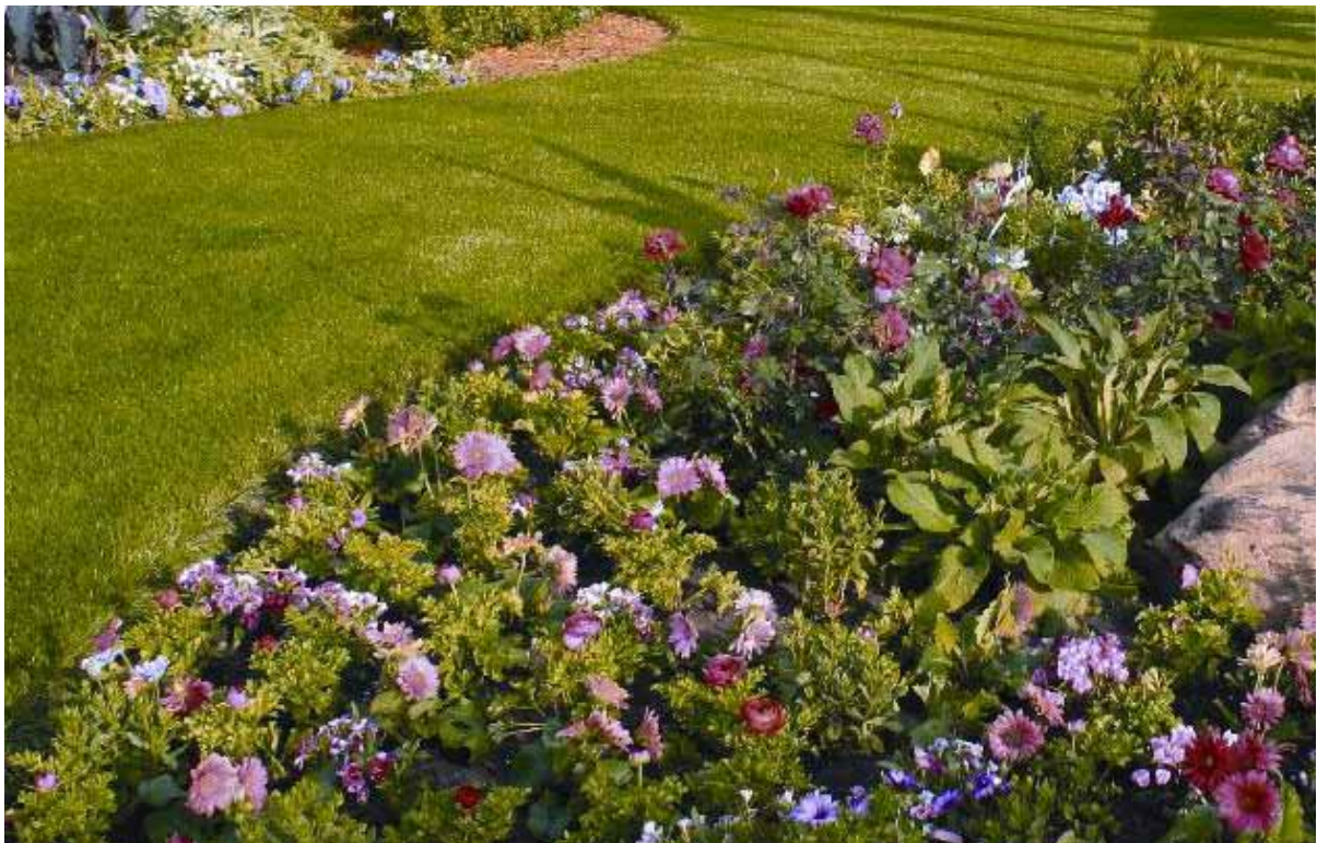
Pixie Hollow Fairy Garden, 2011 Epcot International Flower and Garden Festival, Disney World, Orlando, Florida