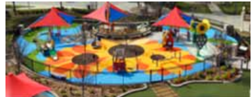
Synthetic turf can come in many colors, like the orange, blue and yellow grass at the Sunflower Preschool Playground at Barnett Family Park in Lakeland, Florida.

Homeowners remove the headaches of ongoing lawn care, adding more leisure time back into their already busy lives.